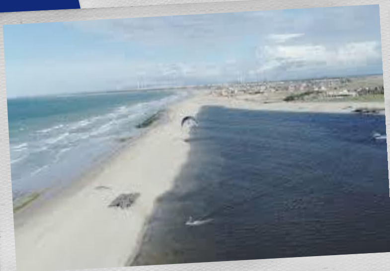
Lagon de Taiba