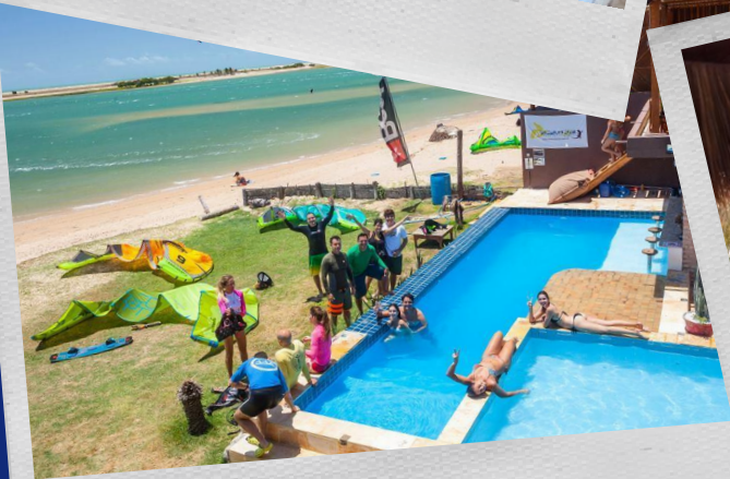
Ilha de Guajuru