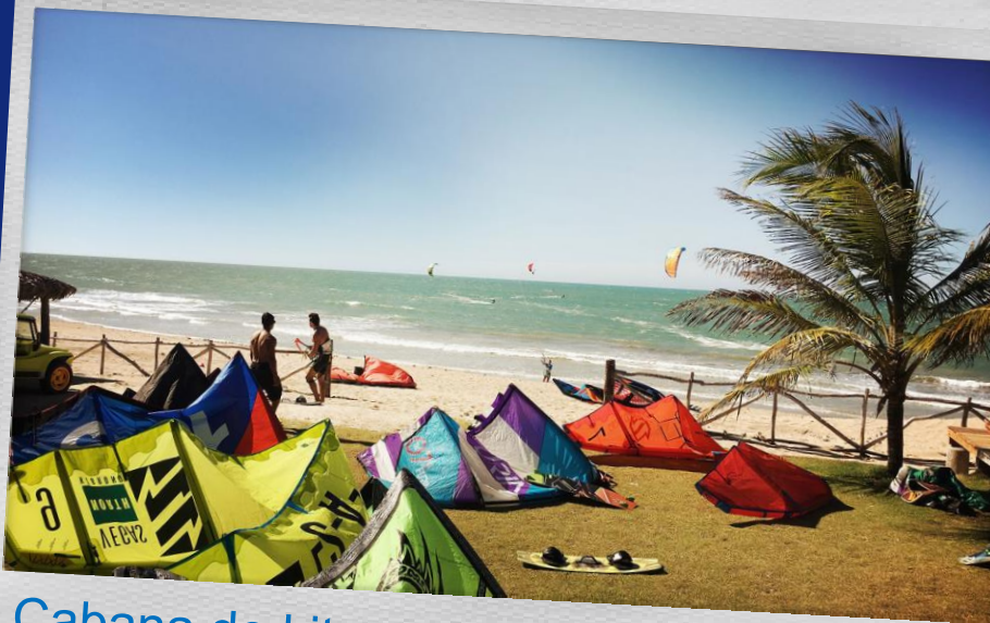
Cabana do kite